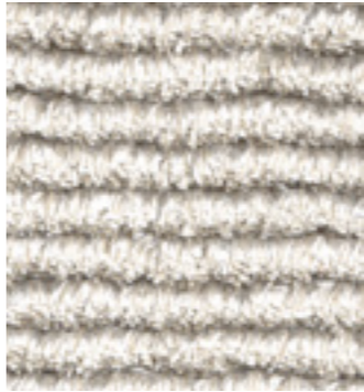
shadow - ghost smoke 3023