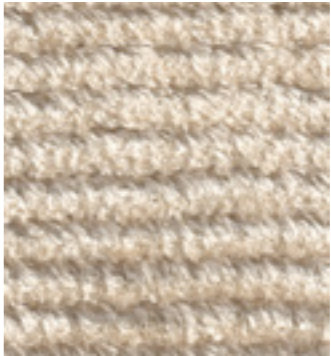
shadow - seashell 3024