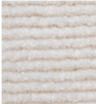
shadow - ice 3016