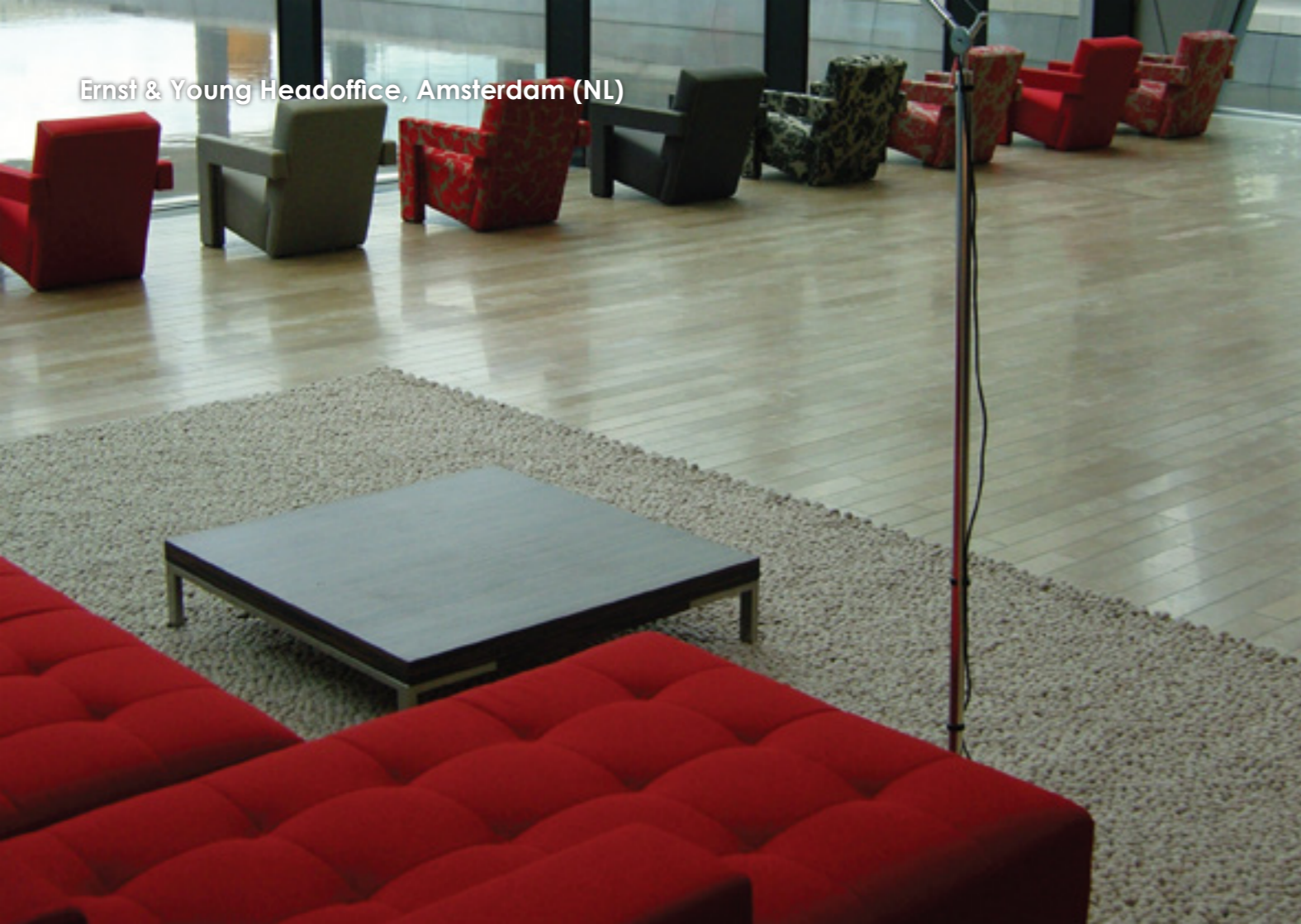
Ernst & Young Headoffice, Amsterdam (NL)