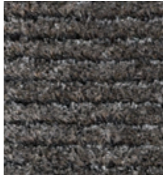
shadow - warm grey 3037