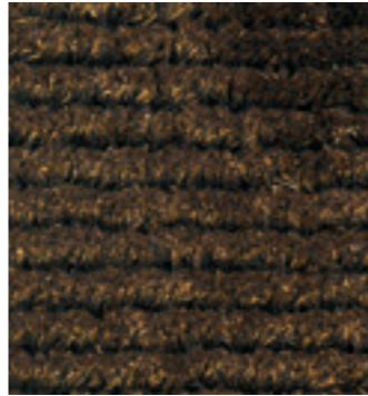
shadow - deep gold 3003

'Shadow' gives that special feeling, as Neil Armstrong described in 1969. His step on the moon was pure magic, a small step...a giant leap... a sculpture, a movement, suddenly stopped, forever, like in Pompeii. Take your first step on the 'Shadow' rug from B.I.C.-Carpets.