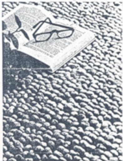
Available from Concepts International, Siomas is now a part of New York's Museum of Modern Art's permanent Architecture and Design Collection.

NEW YORK—The Museum of Modern Art, here, has selected a wool rug for its permanent Architecture and Design Collection.