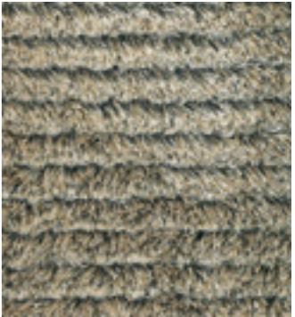
shadow - silver linen 3002