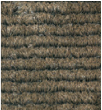
shadow - smoked grey 3004